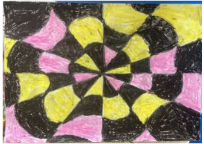
Optical illusion artwork